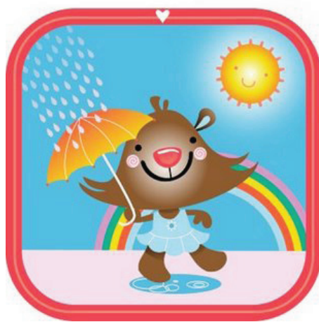
HAVE A SUPER DUPER DAY!